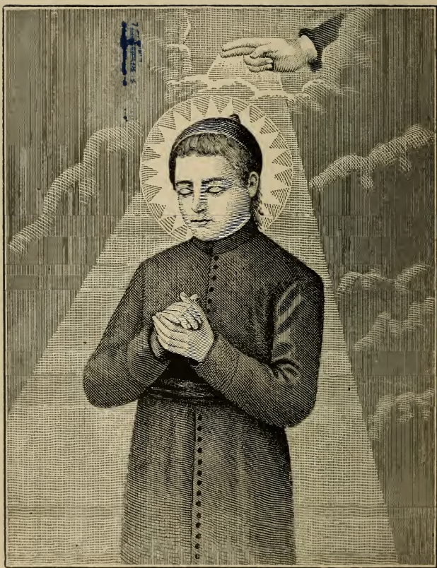
BLESSED JOHN GABRIEL PERBOYRE, C. M. BORN JANUARY 6TH, 1802.